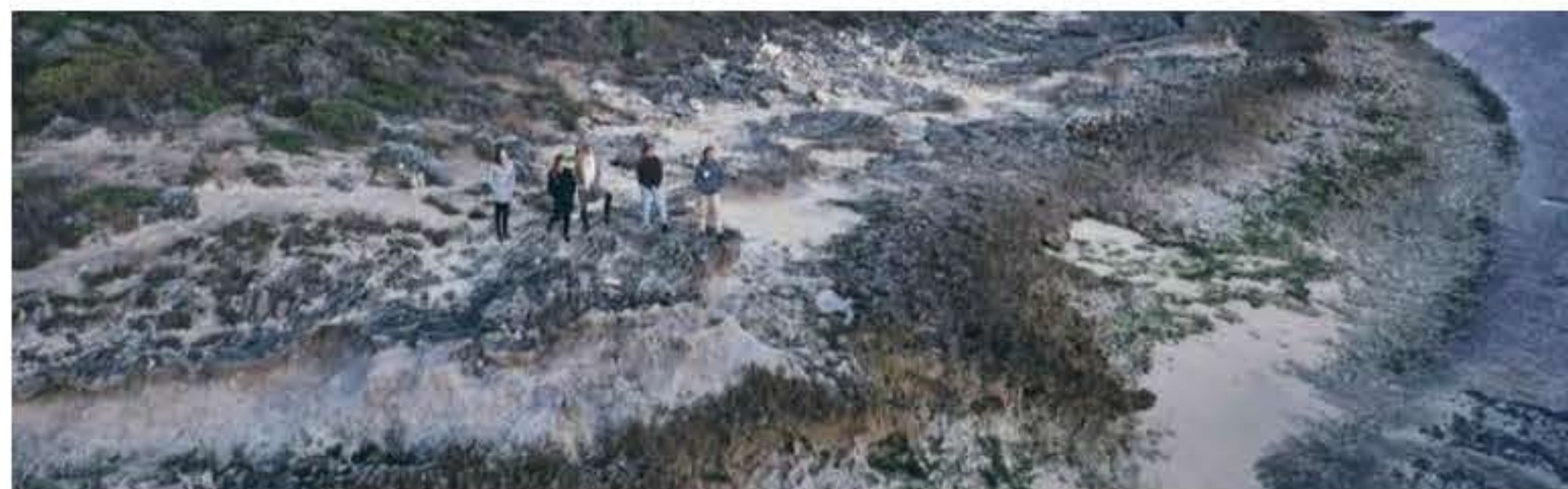
A view of the Gnarabup cliff-tops.